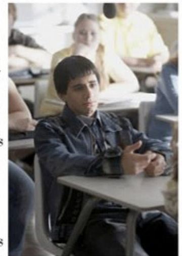
Melkar Muallem as Fadi in "Amreeka," film