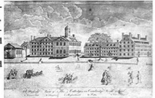
View of Harvard college. Engraved in 1767 by Paul Revere.

But people will never forget how you made them feel'.