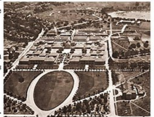
Stanford University Oval — Photo.