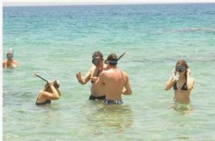
The Chalfoun family ready for a group scuba dive