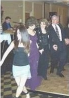
Dancing the Dapkeh