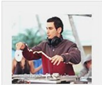
Little Fox DJ